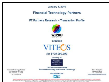
Wipro's acquisition of Viteos for $130 mm