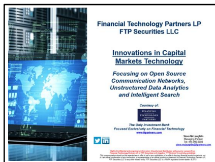
Research Report: Innovations in Capital Markets Technology