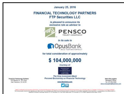
PENSICO Trust Company's Sale to Opus Bank