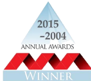
M&A Advisor Awards

FT Partners has been recognized as Investment Banking Firm of the Year and regularly achieves Merger and Financing Deal of the Year recognition