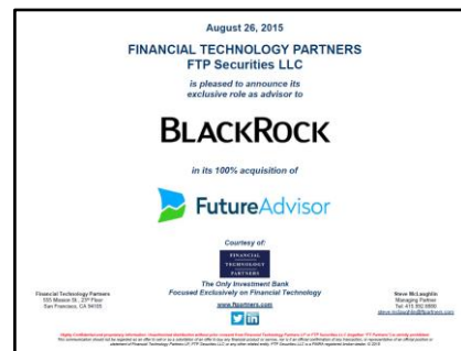
BlackRock's acquisition of FutureAdvisor