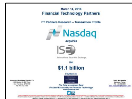
Nasdaq's acquisition of ISE for $1.1 billion

FT Partners regularly publishes research highlighting the most important transactions, trends and insights impacting the global Financial Technology landscape. Our unique insight into FinTech is a direct result of executing hundreds of transactions in the sector combined with over 13 years of exclusive focus on Financial Technology. Please visit our subscription form to subscribe to our exclusive monthly newsletter and receive our research reports.