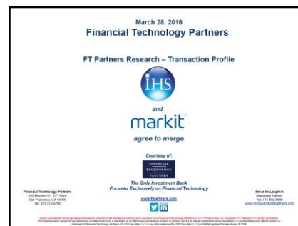
IHS and Markit agree to merge