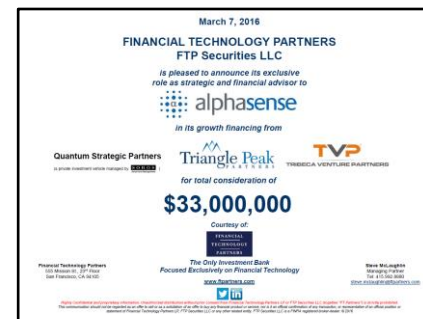
AlphaSense's $33 mm growth financing