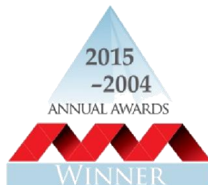
M&A Advisor Awards

FT Partners has been recognized as Investment Banking Firm of the Year and regularly achieves Merger and Financing Deal of the Year recognition