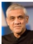
Vinod Khosla Founder & Partner